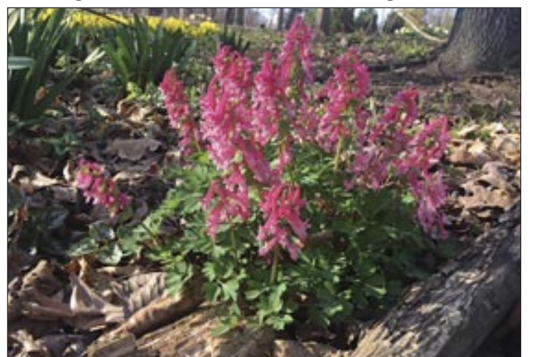
Corydalis solida 'Beth Evans' is a relatively new bulb that offers some variety to the typical spring garden palette of whites, yellows and blues.

Join us the whole month of April as we celebrate Community Banking Month!