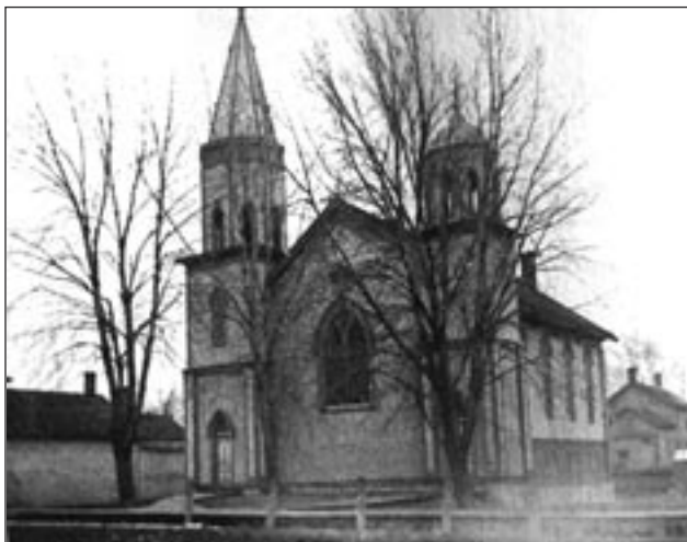
Pictured is the original Bradford First Baptist Church with the original bell tower, which was removed for safety reasons in 1908.