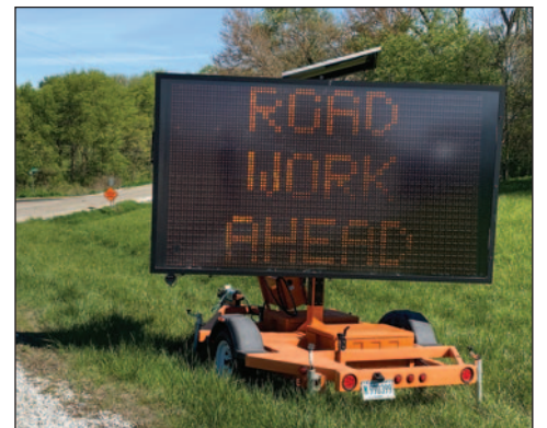
Work has started on resurfacing Elmore Road between Illinois Routes 150 and 78.