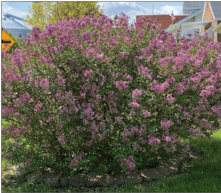
While most traditional lilacs have already bloomed (and are need in of pruning), more modern varieties like 'Miss Kim' (pictured above) are still flowering and are among the many other options for flowering shrubs.

Other species of lilacs provide the same sweet fragrance without the summertime mildew, Syringa pubescens subsp. patula 'Miss Kim', for example. Left unpruned, 'Miss Kim' can grow to 8 feet tall and wide. She blooms a