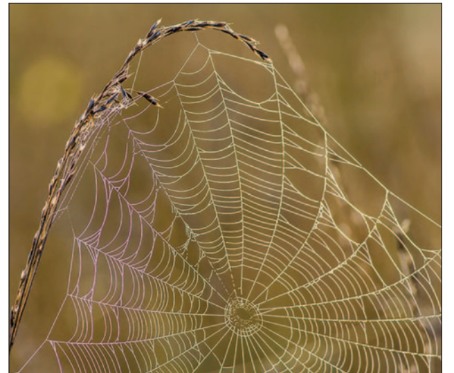
Dewy webs are a good launching pad for young spiderlings in October, when they head airborne and balloon towards a new home.