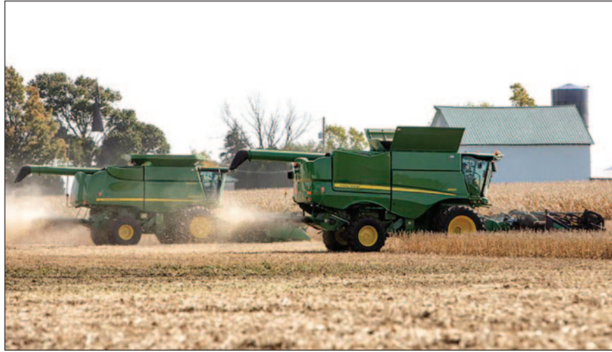
An Illinois farmer harvests crops. Both corn and soybeans could be used to produce sustainable aviation fuel in the future.

The initiative is part of Biden's larger climate goals, which include plans for a fully zero-carbon aviation