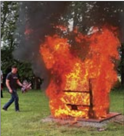
The Galva American Legion held a flag retirement ceremony Monday and buried remains of the flags on Tuesday. Anyone who has tattered flags can drop them off in the box in front of the legion building to be disposed of in the next flag retirement ceremony.

WYOMING – A family comedy about baseball will be shown at the Paramount Theater on June 25 at 3:30 p.m. and June 26 at 3 p.m. The movie is being shown by the Wyoming Chamber of Commerce. Donation entry is $2 and doors