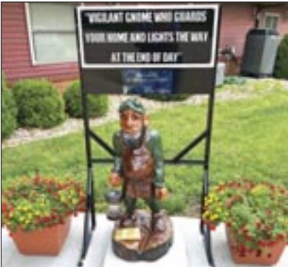
Pictured is the Galva Gnome, located at its new location outside Galva City Hall.