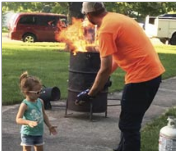
Young helpers got in the act this week to help retire flags during a Flag Day ceremony in Bradford.

were ordered by the Stark County Health Department to cap their septic tanks so that no discharge would enter the local Indian Creek waterway. The Toulon City Council remains frustrated with the contractor because Stark Excavating wants a 240-day extension to the contract that would take it out to this coming December or January. At Tuesday's meeting, Continued on Page 2