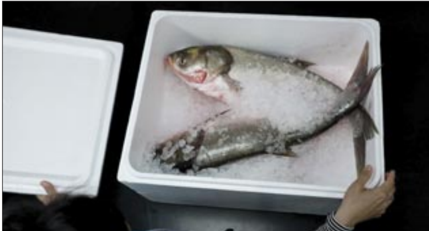
Illinois is attempting to rebrand the name of Asian carp as Copi in an effort to "address public misconceptions about this delicious top-feeding fish." Learn more at choosecopi.com.