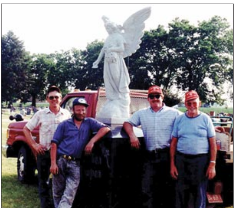
Shown is a large, winged angel carved for the Wyoming Monument Company that sits on top of a 2 1/2-ton block of granite that is in the Chillicothe Cemetery.