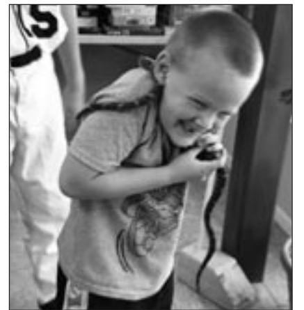
A young Elmwood boy enjoys meeting Milky .

Looking back at it, hatching those babies in an incubator ranks among my greatest accomplishments. I still get panicked thinking about the day