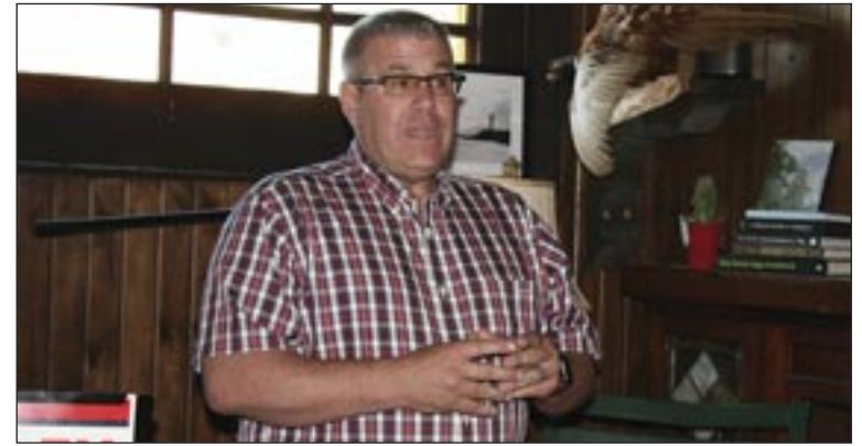
Republican gubernatorial candidate Darren Bailey spoke on June 16 at Bradford's Highlands Restaurant.