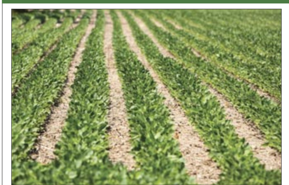
Current projections show Illinois farmers planted 11.2 million acres of soybeans this year and 10.7 million acres of corn. If that holds true, it would be the first time since 1983 that Illinois planted more acres of beans than corn.