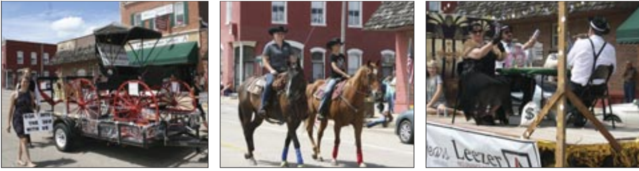
Pictured above are scenes from the 2021 OSA parade with an Americana theme. This year's theme Staying Alive is a nod to 1970's Disco.