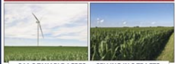
361.2 TAXABLE ACRES± • SELLING IN 3 TRACTS

WEDNESDAY, AUGUST 10, 2022 AT 10:00 AM COT