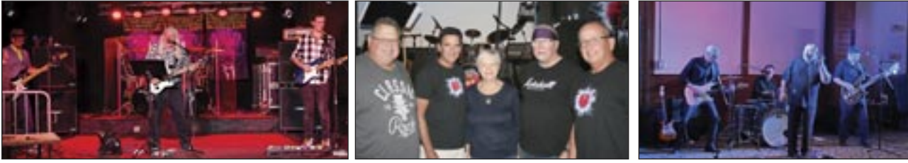
This year's OSA features a diverse lineup of bands including Einstein's Baby, local favorite Electric Tomato and The Valley Katz. See the schedule on page 6 for show times.