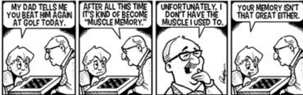
Out on a Limb