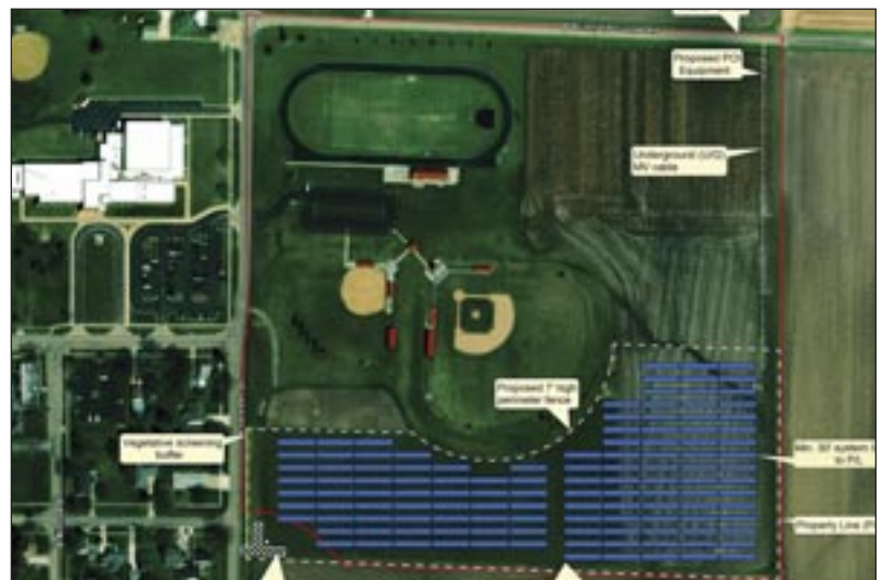
Brimfield CUSD 309 is considering installing a solar array (marked in blue above) east of North Jackson Street and south of the school's ball diamonds.

Lets turn your goals into accomplishments!