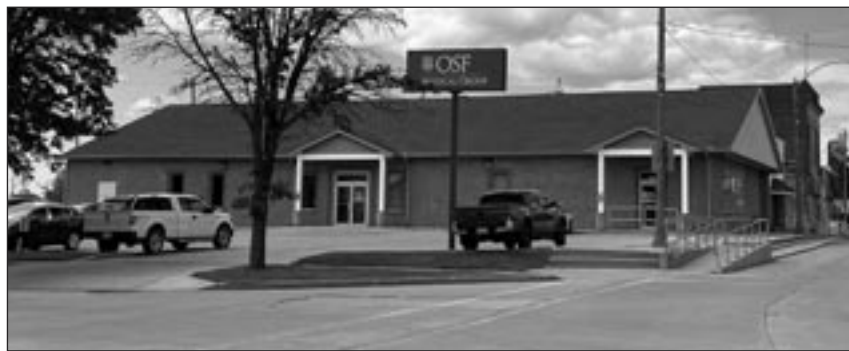
Pictured above is the new OSF Rehabilitation clinic opening soon at the OSF Medical Group location in Galva, at 230 Exchange St., Unit D.

GALVA – Coming soon to Galva is OSF Rehabilitation at OSF St. Mary Medical Center, which is an additional satellite location focused on physical therapy that will open this fall. The new OSF Rehabilitation clinic will be in the same building as the OSF Medical Group location in Galva, at 230 Exchange St., Unit D.