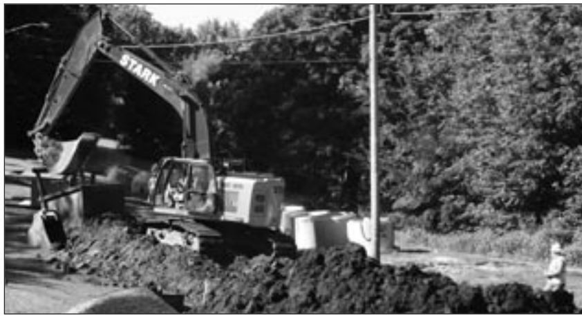
After more than 1 1/2 years, Stark Excavating is moving dirt for the new sewer lift station site at Prairie and Whittaker Streets in Toulon.