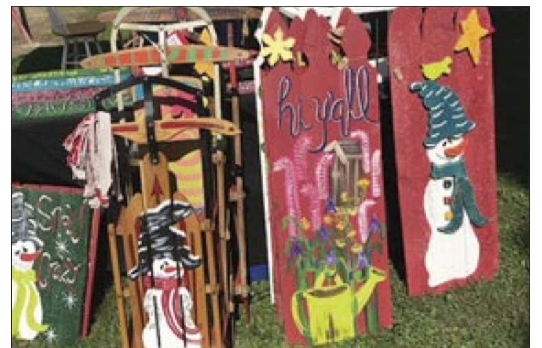
Pictured is a selection of handicrafts offered by vendors at a prior Fall Festival. stand by Rivertown Whiskey • 1 p.m. – Kids games and activities sponsored by Aldrich Company and State Bank of Toulon. hosted by the Stark Continued on Page 2