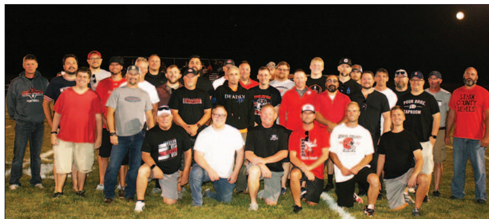
Former Stark County Rebels players and coaches gathered during last Friday’s home game with Knoxville for the first Letterman’s Night at Gary Johnson Field. Also honored during the game were players and coaches from the 1997 team that lost to Galena in the Class 1A state championship game.