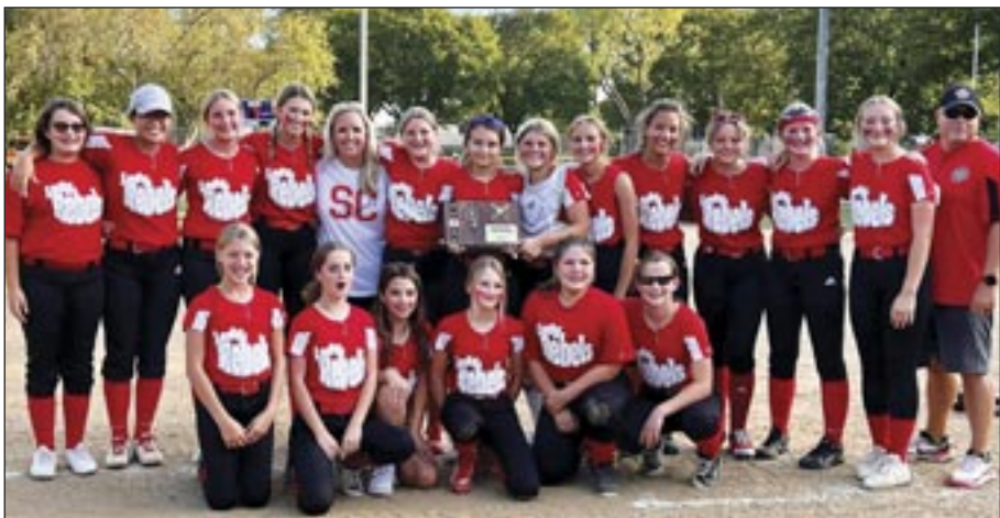
The Stark County junior high softball team celebrated an IESA Class 1A regional title by topping Kewanee Wethersfield, 6-4. Stark County (10-10) then lost to West Central (21-2) last Saturday in a Class 1A sectional at Wenona, 11-0, in five innings.