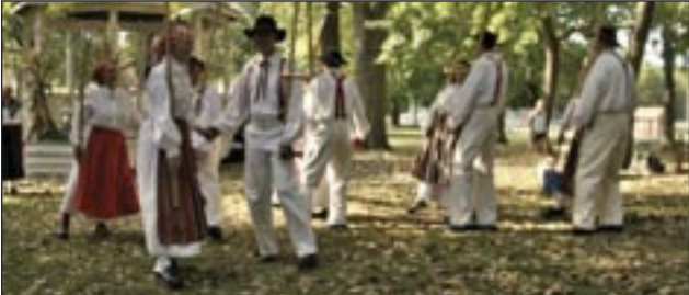
Pictured above are the Nordic dancers from a prior year’s Jordbruksdagarna at Bishop Hill.

BISHOP HILL – Bishop Hill’s 19th century harvest festival Jordbruksdagarna is this Saturday and Sunday, Sept. 24-25, from 10 a.m. to 5 p.m. both days. Demonstrations, hands-on activities, and music are all free. In the village park, artisans will make rope, process flax, carve wood, forge metal, make butter, and more. Vendors will also be selling farm produce, pumpkins, pioneer popcorn, baked goods, crafts, and much more in the park from 10 a.m. to 5 p.m. both days. Musical performances will include Hammer and Pick at noon and 2 p.m., and the Nordic Dancers at 1 p.m. and 3 p.m. each day at the gazebo. There will be a petting zoo located in the northwest corner of the park. Old-fashioned children’s games will also be conducted in the park at 2 p.m. each day.