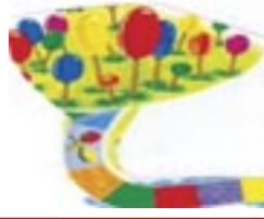
PHOTO WITH SANTA - CANDYLAND BINGO CARD (turkey & ham giveaway) TREE LIGHTING - LIGHTED PARADE VISIT LOLLIPOP WOODS/PEPPERMINT STICK FORREST/COTTON CANDY CASTLE EAGLES SECRET SANTA RAFFLES - TOYS FOR TOTS TAGS & DONATIONS WYOMING CHRISTMAS BASKET DONATIONS LUCY DOTS/TANNERS/POPCORN/UMC COCOA BAR CURRY'S PIZZA/ HUNT BROTHERS PIZZA LUCY DOTS CUPCAKES - TANNERS DONUTS & CIDER UMC COCOA BAR - LEEZER INSURANCE POPCORN ST DOMINICS SOUP SUPPER RETURNS