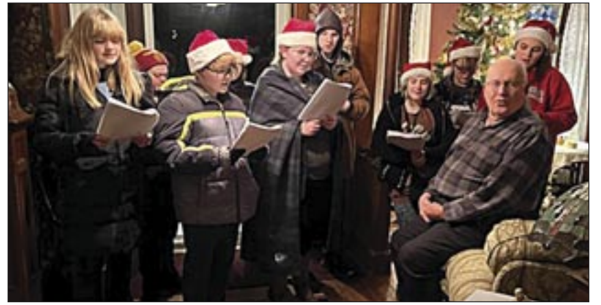
The Student Council and National Junior Honor Society of Bradford spread some Christmas cheer by caroling on Monday night. The members in attendance sang several songs to each household they visited and even had some people sing along. The night ended with hot chocolate and cookies shared back at the Junior High.

Food pantry delivery is once a month and typically at 8:30 a.m. on the fourth Monday of the month. If you are interested in helping with the food deliveries, assisting during regular hours, or have questions,