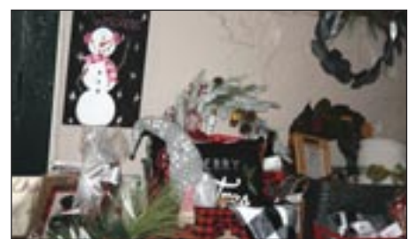
Shown are items that were auctioned off Dec 10 at the Bistro in Toulon after the Christmas Walk celebration.