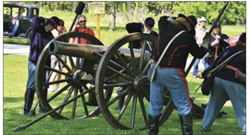
Bishop Hill is planning new activities in 2023, including a Civil War Days festival in May, and a summer concert series, thanks to a $110,000 grant from Henry County.