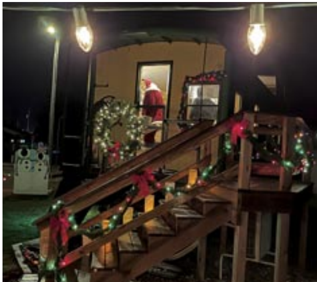
Santa sets up shop in the train caboose at Veterans Park during last Saturday's Winterfest in Williamsfield.