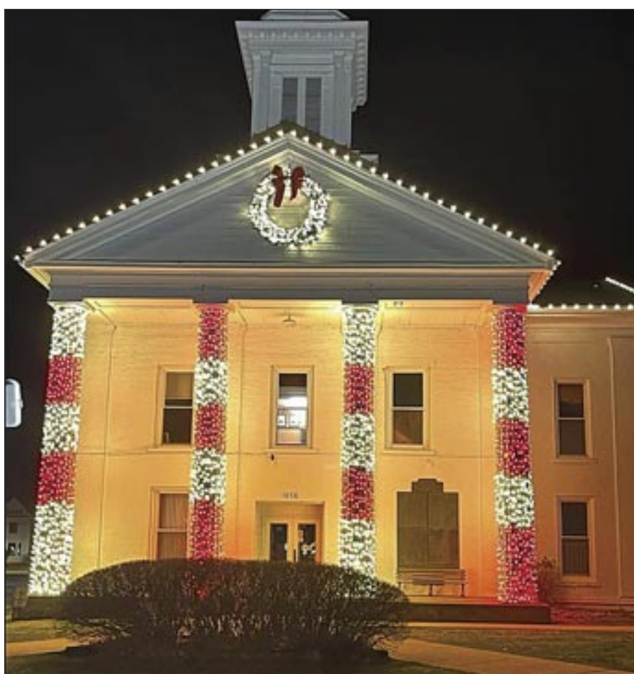
A festive Stark County Courthouse brightens the night in Toulon as another Christmas Day nears. This is our last edition of The Prairie News for 2022, as we will take a week off so staff can spend time with friends and family. We hope you can do the same and enjoy a very happy holiday season. We will resume publication on Jan. 6. Thanks for your support.