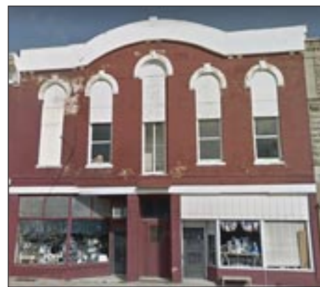
Pictured above is the former ceramic shop, located on Front St. in Galva, which is scheduled to be demolished by July 1.