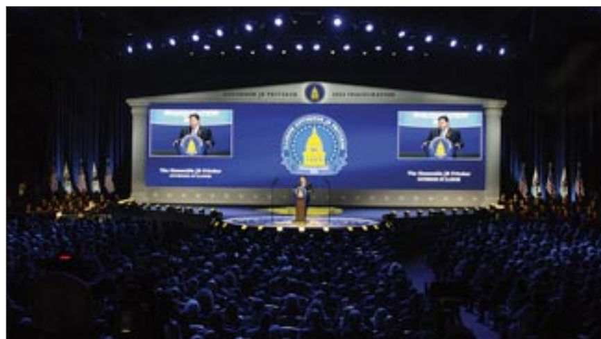
Gov. JB Pritzker had his second inauguration in Springfield Monday.