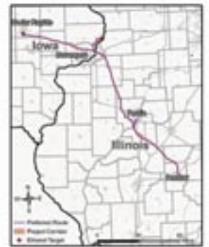
Illustration: Wolf ADM CO2 Pipeline Route Map 2022 with a state 2 mile wide corridor (so exact route not known or public)

Current U.S. and State Regulations do not require any fracture arresters.