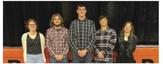
Pictured are the Bradford seniors honored at the senior recognition ceremony.