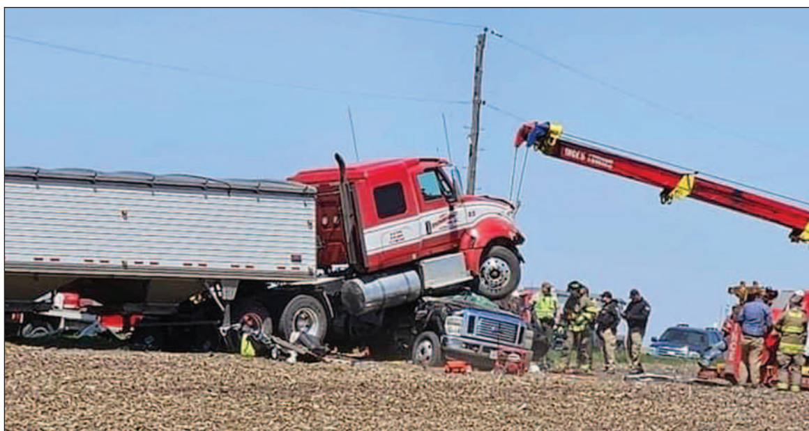
Pictured above is the accident that occurred May 2 on Illinois Route 78. Toulon, LaFayette and Kewanee fire departments responded to the scene, as well as Stark County Ambulance and Lifeflight.