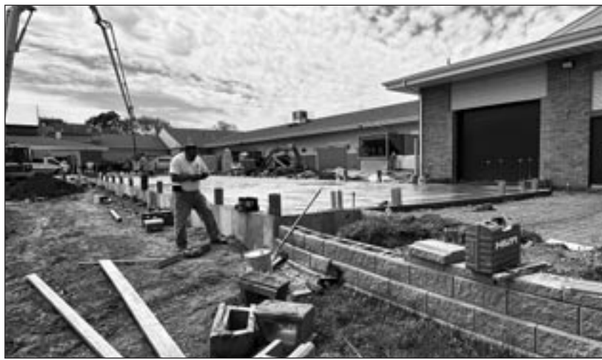
The concrete floor of the Elmwood School District’s new Claude W. Keefer Industrial Arts building was nearing completion Tuesday afternoon. Work on the building is expected to be completed in time for the start of the 2023-24 school year.

Parents are encouraged to stay for the electricity session beginning at 9