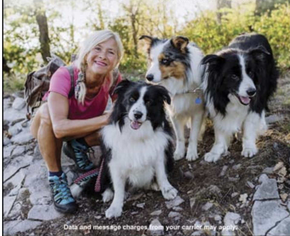
Data and message charges from your carrier may apply.

A Division of Morton Community Bank Member FDIC www.HometownBanks.com