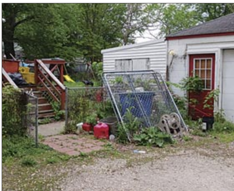
A shed behind Stacy Mueller's Princeville home housed 12 dogs that had no food or water and were covered in feces. As a result, Mueller faces 12 felony counts of aggravated cruelty to animals.

What Peoria County law-enforcement officials accuse the Princeville dog groomer of doing might be considered the opposite of adora-