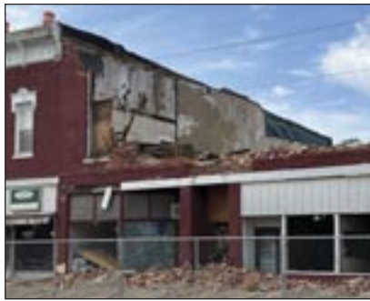
Demolition work on Front Street in Galva has been halted.

The bid of $268,900 was awarded to Ratliff of Kewanee for taking down the buildings, which were abandoned and in disrepair.