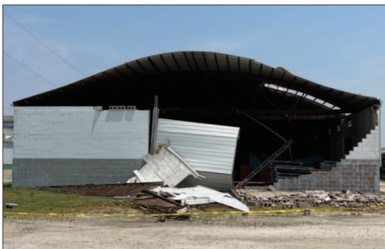
Pictured is the partially collapsed building at 123 Front St. in Galva. Street barricades have been installed in case of further collapse.