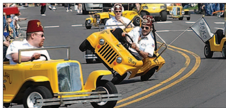
The Shriners' cars will return to the revived Spoon River Days parade in Wyoming on June 10.