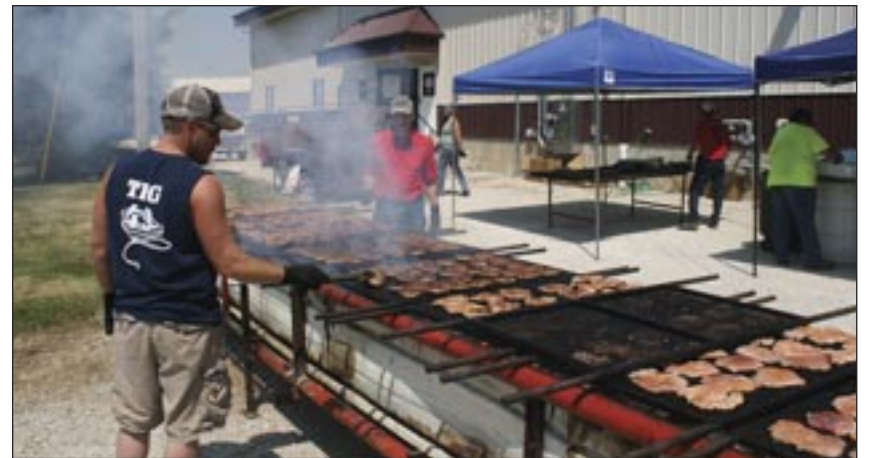
Bradford Fire Company personnel barbeque pork chops, pork burgers and pork cutlets last Saturday at the Annual Bradford Hog Roast.