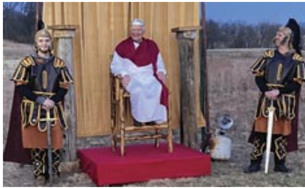
Roman soldiers, live animals and other characters are all part of the annual Live Nativity held by Boyd's Grove United Methodist Church.

Entering the church's annual Live Nativity at the Grunloh Farm near Milo helps you forget the hectic, commercialized holiday pressures. Instead, you can experience an uplifting and almost spiritual feeling as