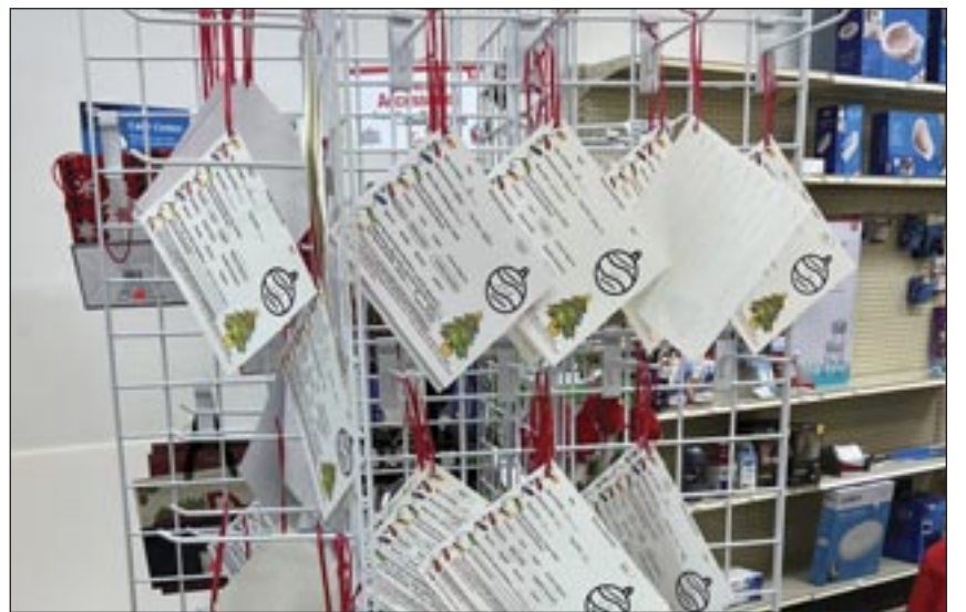
Love Tree ornaments are available for pick-up at Galva Pharmacy. There are 70 needy children's ornaments available with sizes and wants on them. TGfts must be dropped off at Galva City Hall on Thursday, Dec. 7, from 8 a.m. to 4:30 p.m.; Friday, Dec. 8, from noon to 4:30 p.m. or Saturday, Dec. 9 from 8-11 a.m. The event is sponsored by the Xi Kappa Gamma Chapter of Beta Sigma Phi.

Daily attractions include Swedish folk characters, traditional Swedish holiday decorations, holiday music, crafts and Christmas gifts for sale.