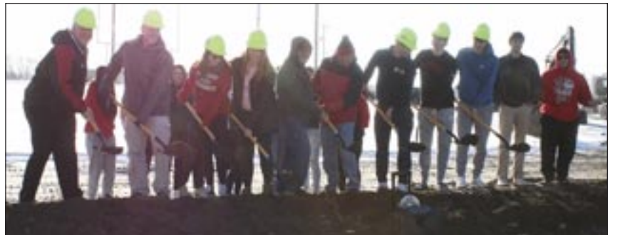
The Stark County School District broke ground at Stark County High School on Nov. 28 for a new all-weather track. In attendance were members of the school faculty, school board and students.