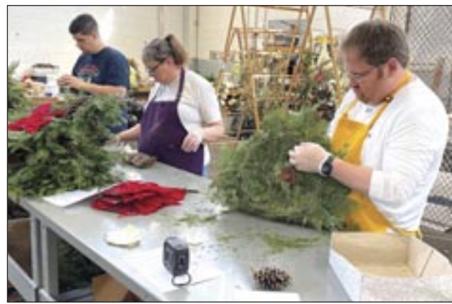
Individuals in the Abilities Plus work services program are busy decorating wreaths for Sunday's 1-3 p.m. open house.