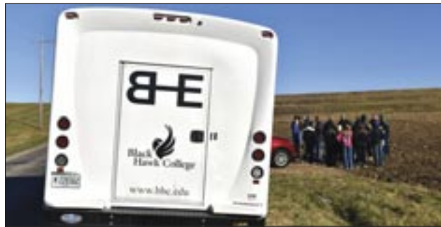
Pictured above, Black Hawk East students on site observing soil and water conservation in practice.