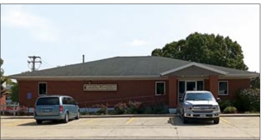
Pictured above is the new Stark County Health Department's First Choice Healthcare Clinic in Toulon, which will open its doors on Dec. 11. The clinic exists thanks to a partnership with the State Bank of Toulon, First Choice Healthcare and Onero Rx, Inc. - Local Health Inc. The facility is located at 120 E. Court St. in Toulon.

New clinic opens Dec. 11 in Toulon For The Prairie News Toulon – The Stark County Health Department will open its new First Choice Healthcare Clinic in Toulon on Monday, Dec. 11. The Health Department has entered into a partnership with the State Bank of Toulon, First Choice Healthcare and OneroRx Inc.- Local Health, Inc., to bring this new multi-service facility to Stark County. The clinic is located in the former Aunt Martha's-Great River Community Health Center location at 120 E. Court St. Clinic hours will be Monday through Friday