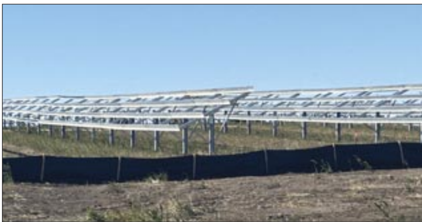
While this solar field south of Yates City has been completed, new projects are sprouting in fields across central Illinois.