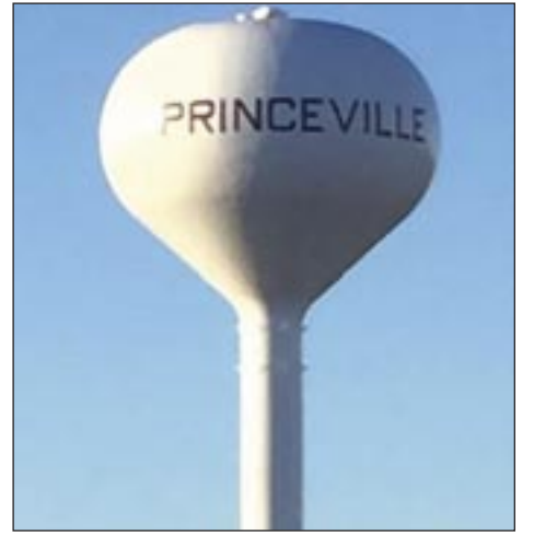
Officials in Edelstein and Princeville are hoping a federal grant will help pay for a 7-mile pipeline to bring Princeville water to Edelstein, whose current well is deficient.