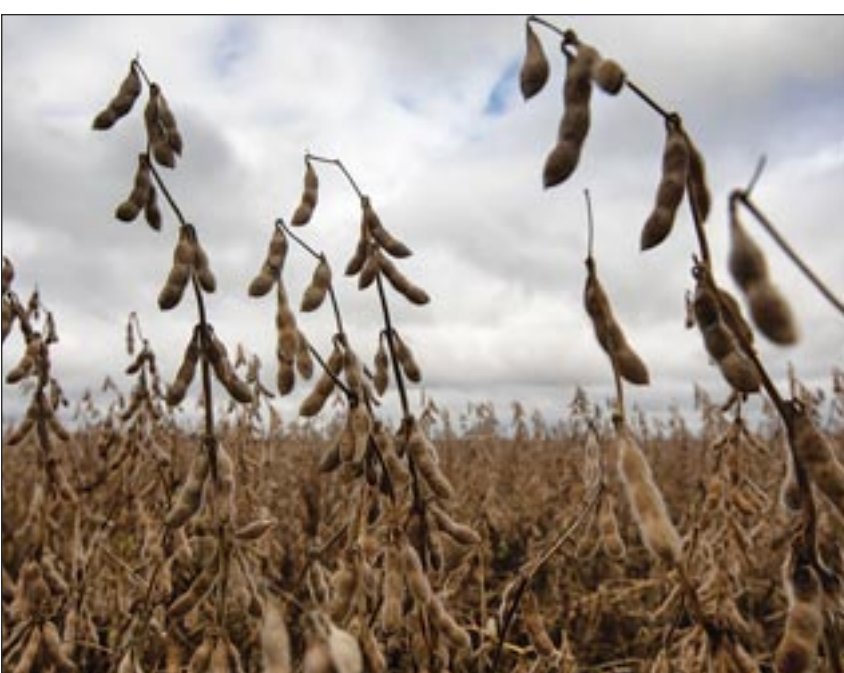
Illinois produced some of the largest crops of any state last year despite drought and other weather challenges, according to the USDA.

The trend of higher-than-expected yields was also evident nationwide