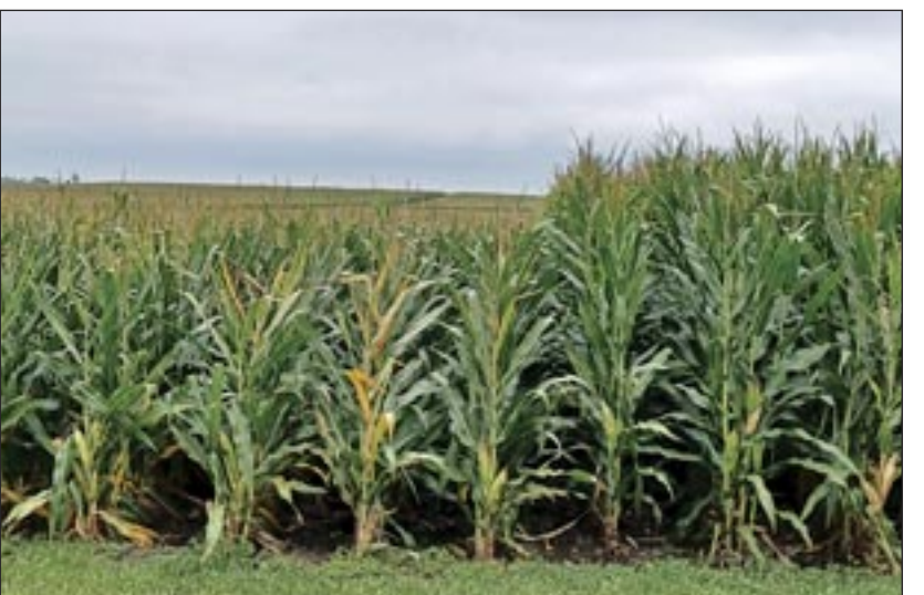
Seed companies are working to develop shorter varieties of corn to help avoid damage to plants during wind events.

By RON DIETER For The Prairie News Mention the state of Iowa and images of vast fields of corn reaching for the summer sun come to mind. Like Illinois, Iowa is synonymous with corn. Both Iowa’s official and unofficial state songs mention corn. The unofficial, but way more popular song is “The Iowa Corn Song,” which repeats in every refrain, “We’re from I-O-way, I-O-way. That’s where the tall corn grows.” Fields of tall corn in Iowa and here in our own Prairie State soon may be a rare sight as crop scientists work to shorten the distance from root to tassel. They aim to strengthen the crop against weather’s havoc and increase yield in the process. The effects of Iowa’s