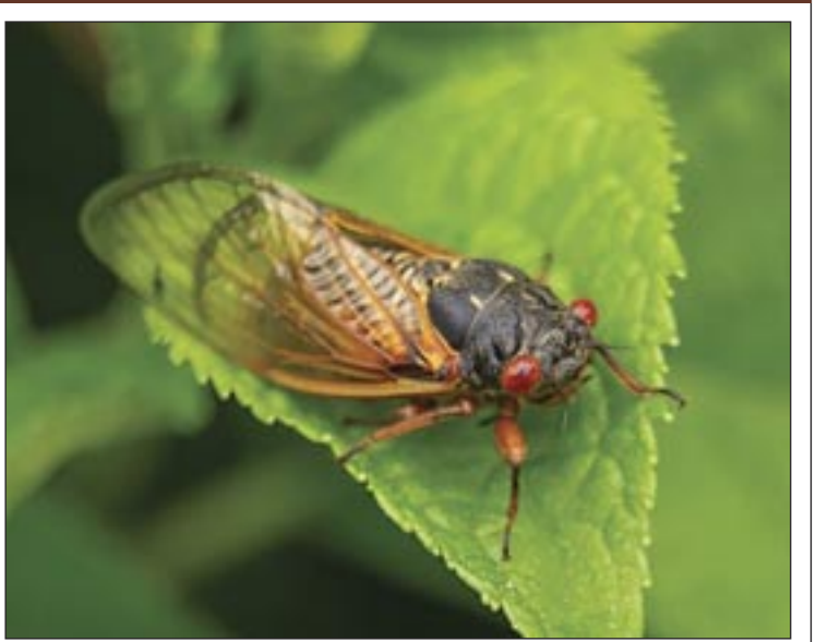
Periodical cicadas will be emerging across much of Illinois in 2024.