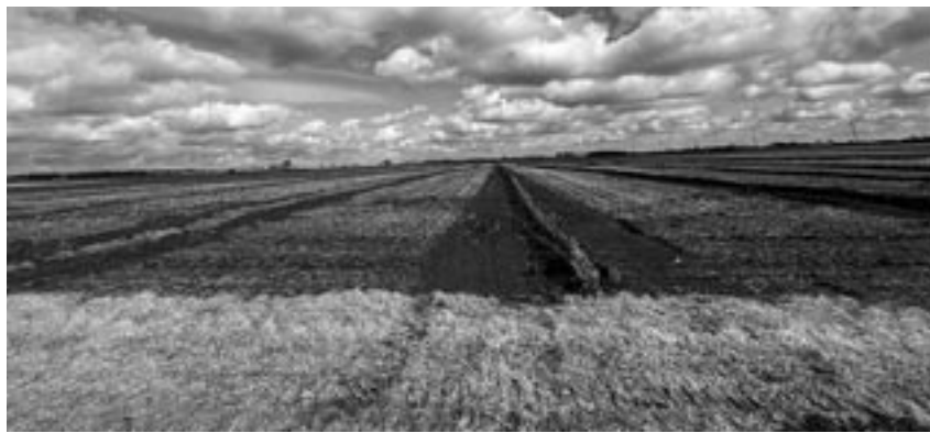
The University of Illinois' new Alma Mater Plots will include 64 test plots with 16 treatments and four replicants. The plots are located at the start of the Embarras River in Champaign County.

The Alma Mater Plots will be over 70 times the size of the Morrow Plots. Additionally, each plot will be center-tiled and have a buffer tile. The center tile will monitor the amount of water draining from the field and the nutrients that