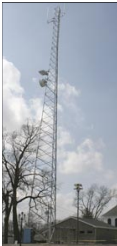
A new 180-foot communication tower has been built for Stark County's Enhanced 911 service. The tower is east of the E911 service center added to the jail building in Toulon.