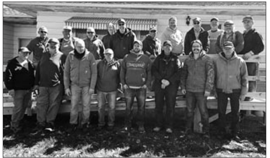
A group of 19 volunteers installed this ramp at a Wyoming home on April 6.

Wyoming's resident wrote a letter to the Saturday morning crew members, saying, "I would like to take this time to thank you and may God bless all of you for building this change in my life ramp. I have been trying to get this ramp for five years. Six attempts have let me