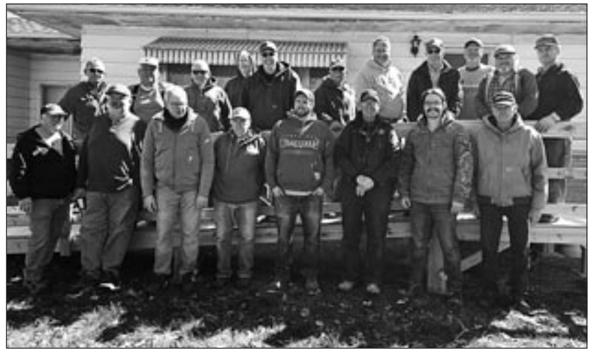
A group of 19 volunteers installed this ramp at a Wyoming home on April 6.

Wyoming's resident wrote a letter to the Saturday morning crew members, saying, "I would like to take this time to thank you and may God bless all of you for building this change in my life ramp. I have been trying to get this ramp for five years. Six attempts have let me