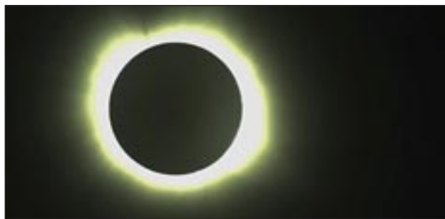
The total eclipse as seen in Carbondale.

"I have been able to get outside the stadium, there are thousands of people out there as well on the SIU campus and throughout the region," Ross said.