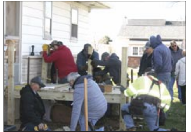
Volunteer workers assemble a ramp at a home in Wyoming on April 6.