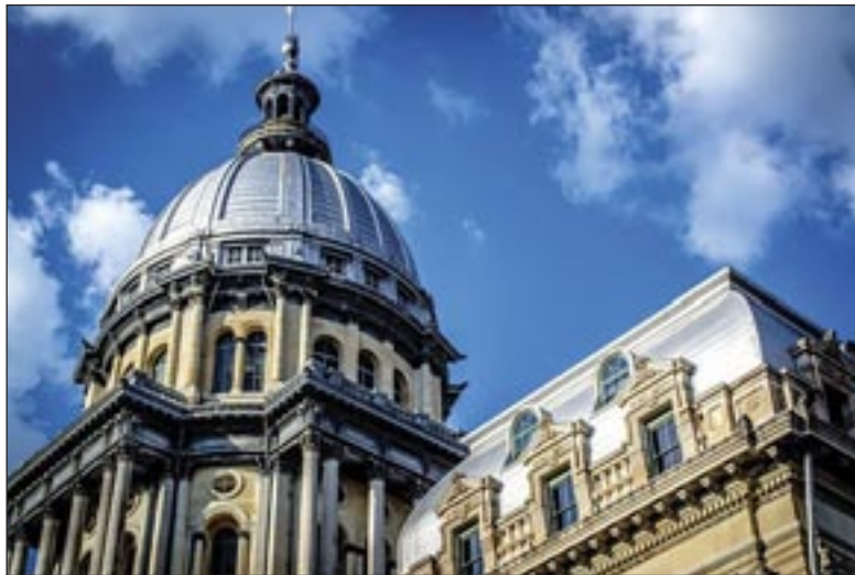
Illinois legislators have passed hundreds of bills so far during a legislative session that is scheduled to end on Friday.

The measure is a response to an Illinois Supreme Court ruling last