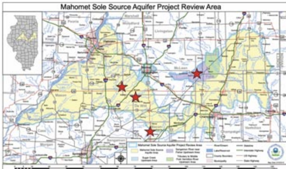
★ Sequestration projects under review by the U.S. EPA