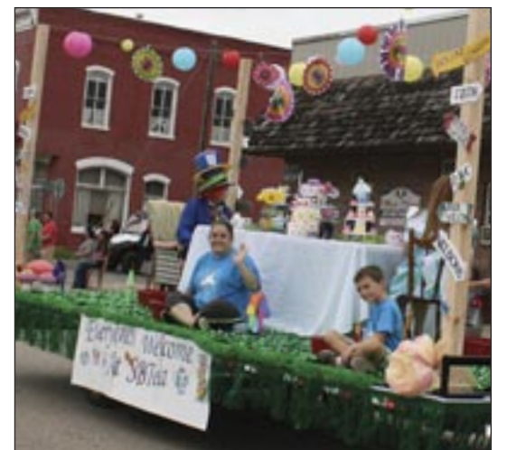
State Bank of Toulon had an Alice in Wonderland themed float in the 2023 OSA parade.

Activities continue Saturday, Aug. 3, starting with the Indian Creek 5K run at 8 a.m. The day also features a craft show and flea market, a 3-on-3 basketball tournament, a cruise-in from 10 a.m. to 2 p.m., a quilt show at Toulon Methodist Church, kids events, a parade starting at 2 p.m., bingo from 7-8 p.m. and live music, including the Electric Tomato at RBAR at 3 p.m. and Written Warning on the main stage at 8 p.m.