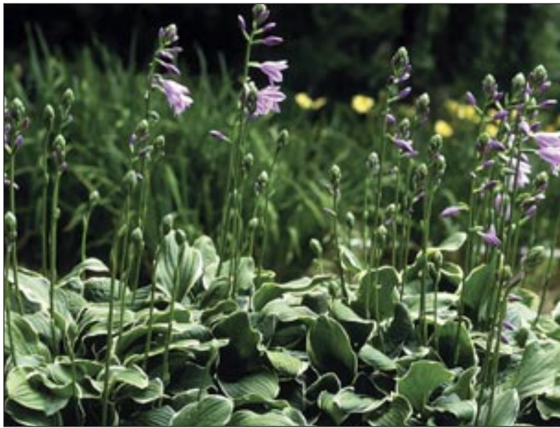
Feel free to prune flower stalks on hostas whenever you see fit, without damage to the plant.

The first question is from Camelia Airhart who asks, "My hostas are done blooming and the dried-up