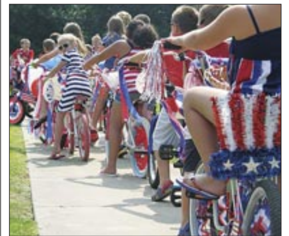
Youngsters in Farmington decorated their bicycles for the city's July 4 parade.