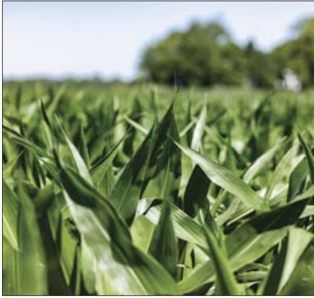
In Illinois, the USDA estimates farmers planted 10.9 million acres of corn this season, down 300,000 acres from last year, and 10.7 million acres of beans, up 350,000 from 2023.

"Planted acreage surprised the corn trade," Karl Setzer, market analyst with Consus Ag Consulting, told FarmWeek. "The big question is how much of those acres may