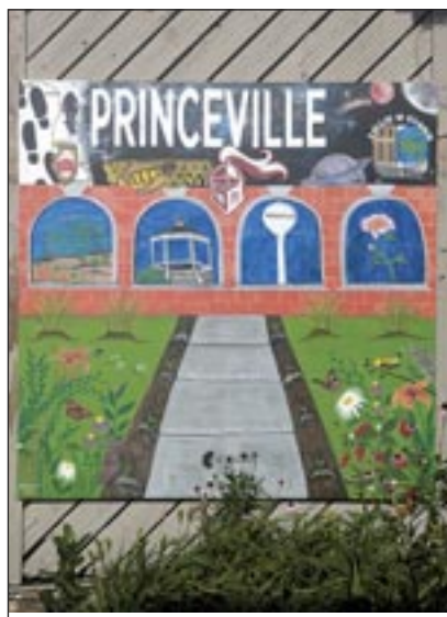
Princeville's Lillie M. Evans Library has added a mural to its community garden area using Libraries Transforming Communities grant funds.

American Library Association that offer more than $7 million to small and rural libraries to increase the accessibility of facilities, services and programs to better serve people with disabilities.