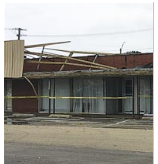
The facade at Midland Plaza in Kewanee suffered extensive damage during the July 16 storms that resulted in Henry County being declared a state disaster area late last week.