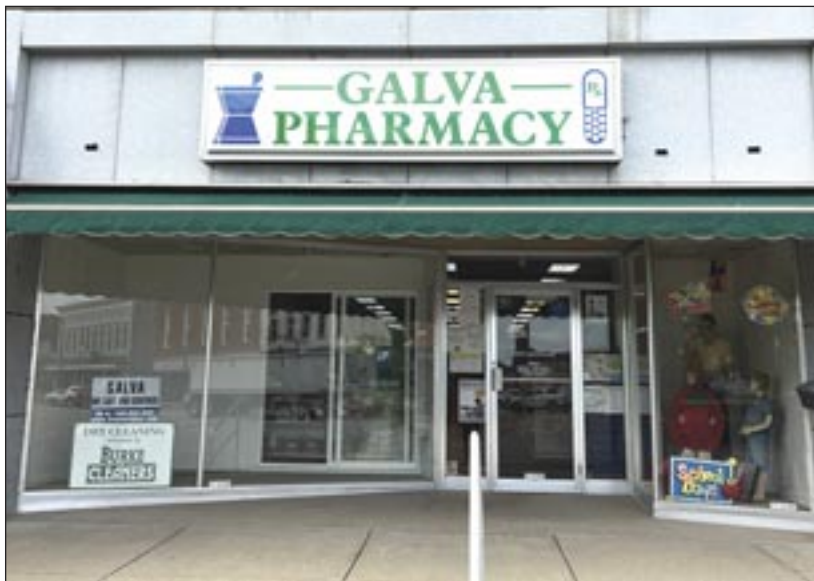
Galva Pharmacy, at 120 N. Exchange St., in Galva, will close and cease operations after Tuesday, Sept. 10.

The last day of business at the downtown business located at 120 N. Exchange St. will be Tuesday, Sept. 10. After that, all prescriptions will