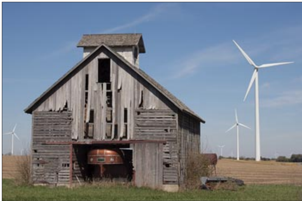
Wind turbines frame a weather-beaten barn near the Mendota Hills Wind Farm in northern Illinois.

Schools account for most of the money the proposed project is expected to generate for 20 taxing bodies in its 24,000-acre area.