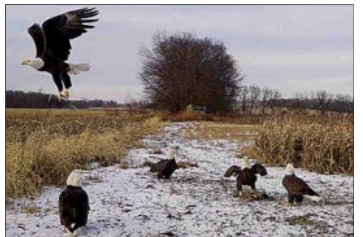
Five bald eagles sort out pecking order around a raccoon carcass in Knox County, not far from the Spoon River.