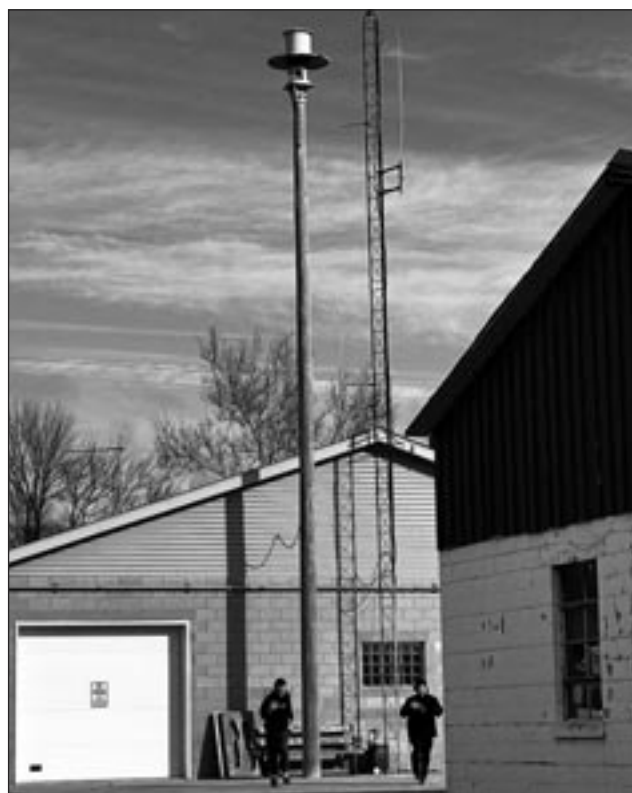
During the monthly test, two of the visitors to Yates City ran toward the village’s weather-warning siren.