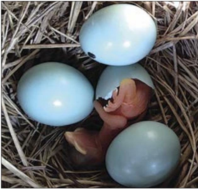
Bluebirds typically lay four or five light-blue eggs in a nest, though some eggs can be white. The incubation period is 13-14 days from the date of the last egg laid. Nestlings remain in the box 17-21 days.

He also attaches a 4-inch aluminum dryer vent to the conduit below most boxes. The slippery vent serves as a baffle that helps stop raccoons. Coating the pole with automotive grease will also help.