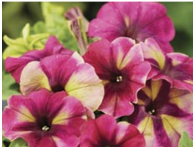
A group of petunia multiflora var. Shake Raspberry F1 flowers in bloom.

• Nasturtium Baby Red (Tropaeolum minus var. Baby Red): Uniform and compact, Baby Red has rich red flowers on dark