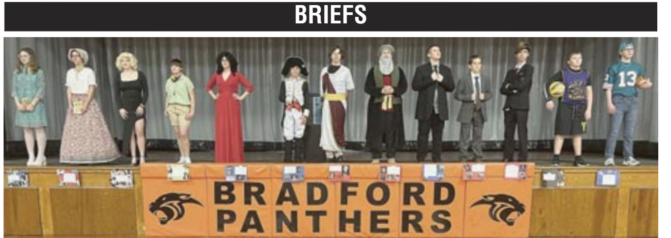
Pictured above are Bradford 8th grade students who recently held a living museum with five categories, including notable authors, historical figures, notorious criminals and sports figures.