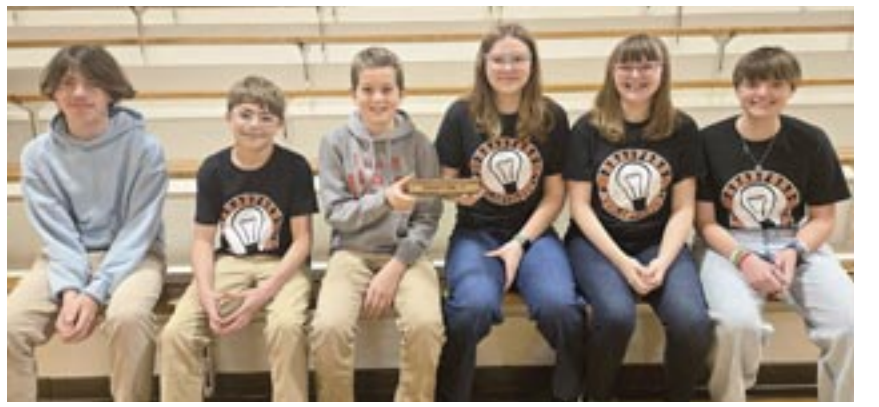
Bradford Junior High School's 2025 Scholastic Bowl team finished a perfect season with zero losses, earned the Conference Championship title and won the conference tournament.