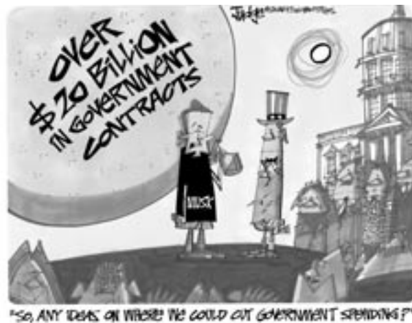
"So ANY IDEAS ON WHERE WE COULD CUT GOVERNMENT SPENDING?"