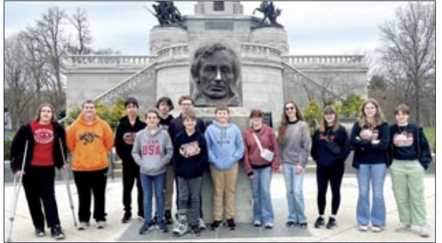
Bradford 8th graders enjoyed their annual school trip to Springfield last week.