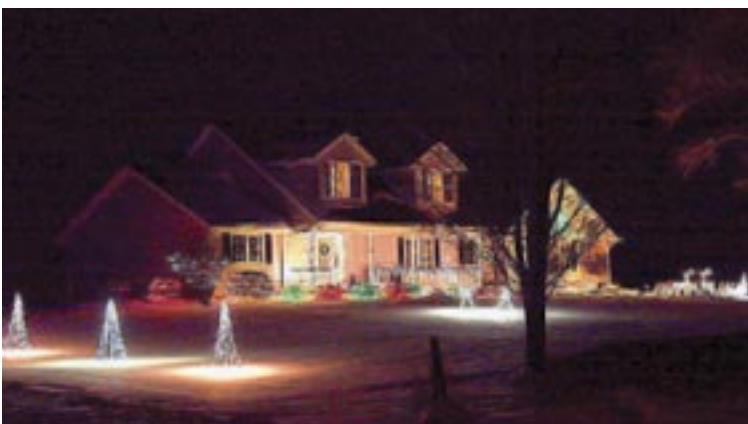
Pictured above is one of 17 locations entered in the Galva Arts Council Tour of Lights contest. Voting concludes on Dec. 20, when winners will be announced.