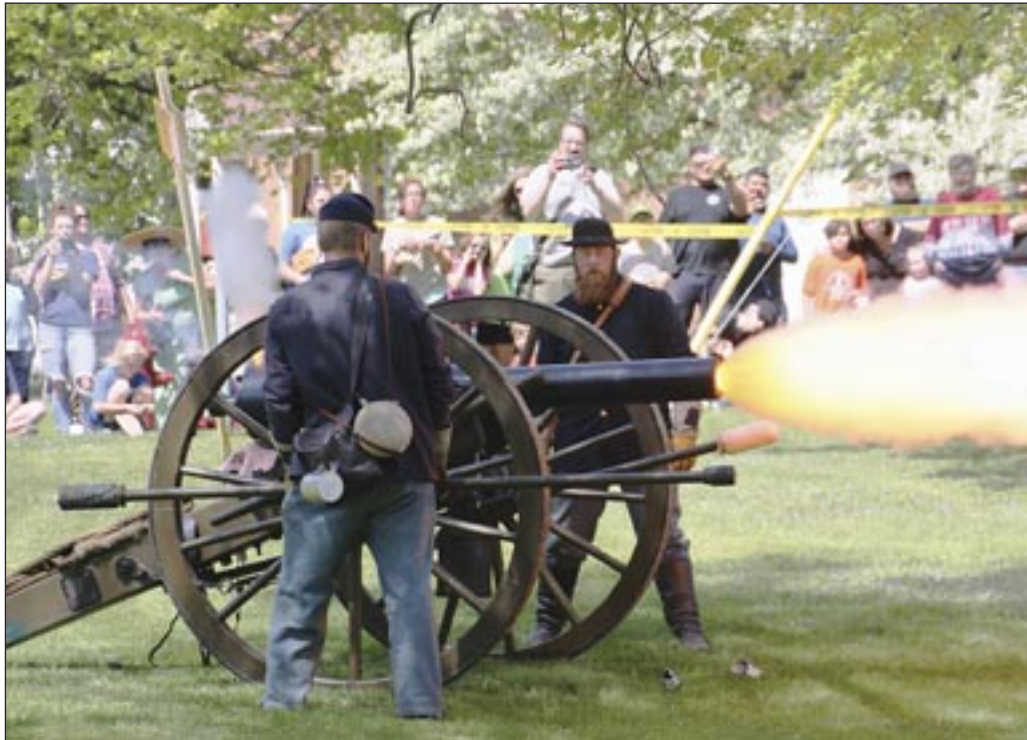
A cannon is fired during an artillery demonstration presented by the Bishop Hill Heritage Association. Below: Union troops march into battle.