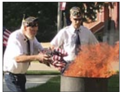
Pictured above, a U.S. flag is respectfully retired, at the Bradford American Legion 445 flag retirement ceremony, held on June 14 at Elsie Hodges Park in Bradford.

Village businesses will have yard games set up for visitors to play during the day. The Creative Commons will feature a free performance by a