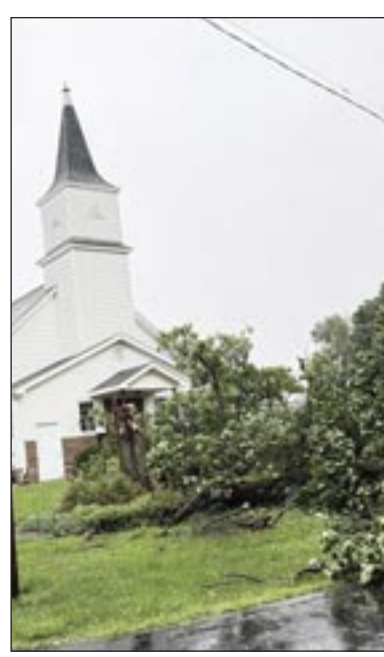
Above: Heavy rain and wind on June 17 toppled a tree in front of Dahinda United Methodist Church. At right: The storm that tore through the area last week damaged the roof of the building that Rux Funeral Home leases in Williamsfield. Submitted photos.